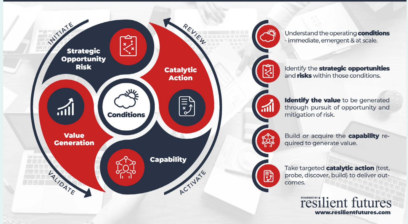
Diagram as used in leadership retreat for the National Australia Bank

A continuous cycle of change through the five elements, in any period of time (day, week, month), to create strategy that allows a timely response to changing conditions and underpins a strategic approach to leveraging disruption.